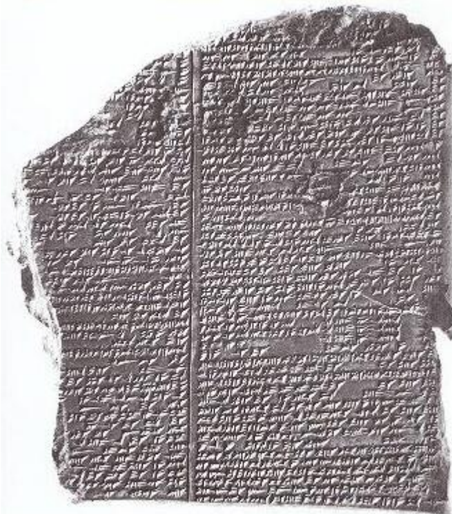
A fragment of a tablet showing the story of the flood, inscribed in Assyrian cuneiform characters.

-'Then was the launching full of difficulty; there was shifting of ballast above and below till two thirds was submerged. I loaded into her all that I had of gold and of living things, my family, my kin, the beast of the field both wild and tame, and all the craftsmen. I sent them on board, for the time that Shamash had ordained was already fulfilled when he said, "in the evening, when the rider of the storm sends down the destroying rain, enter the boat and batten her down." The time was fulfilled, the evening came, the rider of the storm sent down the rain. I looked out at the weather and it was terrible, so I too boarded the boat and battened her down. All was now complete, the battening and the caulking; so I handed the tiller to Puzur-Amurri the steersman, with the navigation and the care of the whole boat.