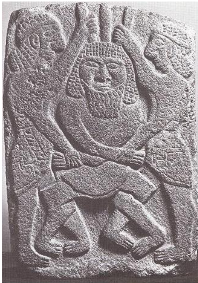
Gilgamesh and Enkidu's battle with Humbaba.

Gilgamesh replied: 'Where is the man who can clamber to heaven? Only the gods live for ever with glorious Shamash, but as for us men, our days are numbered, our occupations are a breath of wind. How is this, already you are afraid! I will go first although I am your lord, and you may safely call out, "Forward, there is nothing to fear!" Then if I fall I leave behind me a name that endures; men - will say of me, "Gilgamesh has fallen in fight with ferocious Humbaba." Long after the child has been bony in my house, they will say it, and remember.' Enkidu spoke again to Gilgamesh, 'O my lord, if you will enter that country, go first to the hero Shamash, tell the Sun God, for the land is his. The country where the cedar is cut belongs to Shamash.'